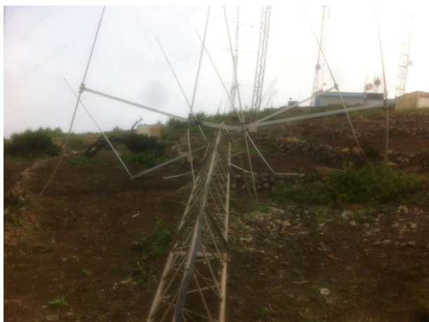
15m: NA and SA on the ground

The D4C Contest Team onsite support's guy, prompted reacted by an immediate site survey. Though being accustomed to high winds on top of the Monteverde mountain, the local maintenance man could not believe to his eyes. It was very cloudy weather and he could not find the 15m tower with NA and SA Antennas anymore, as it was lying on the ground. Both antennas were mechanically still connected to the mast. Additionally, 10m tower was bent and one section slipped downwards but being still hold by an antenna boom !