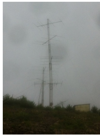
10m bent tower

Remark: All other 12 antennas are in perfect conditions and we suggested to rebrand the Momobeam HD line yagi as HURRICANE DESTROYER!