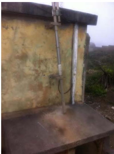
6m, 2m 70cm D4C/B beacon mast